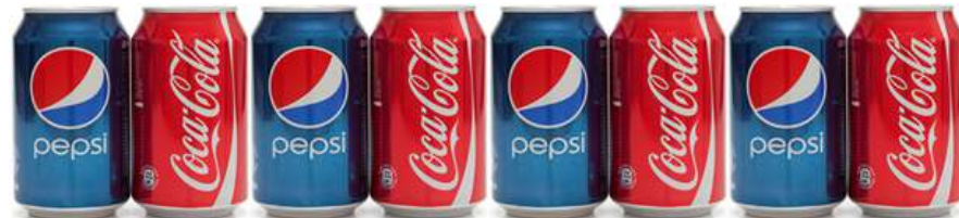
Shares that share a sub-industry are what it's all about.