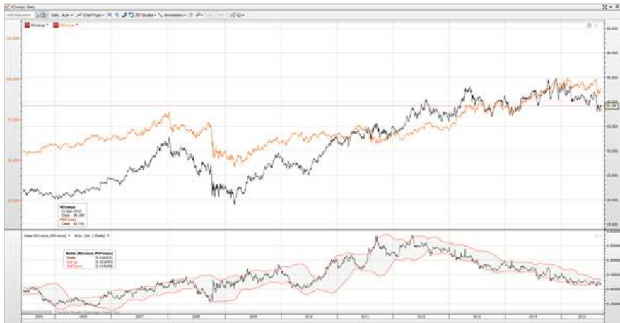
Chart: Coca-Cola (KO:xnys) and Pepsico (PEP:xnys)

Example: Say Coca-Cola (KO) trades at $48 and Pepsico (PEP) trades at $80. The ratio is thus \$48 / \$80 = 0.6 . Let us further say that the mean of this ratio over the last 63 days is 0.5 and the standard deviation is 0.05, then the z-score is given by: (0.6 - 0.5) / 0.05 = 2 . KO thus looks expensive compared to PEP so we short two shares of KO for every share bought in PEP, betting on the ratio (0.6) moving closer towards the 63-day mean (0.5). When this happens we exit the positions. (The ratio and the Bollinger Bands® around the ratio are both readily available tools in the SaxoTrader toolbox. A z-score can also be constructed directly.)